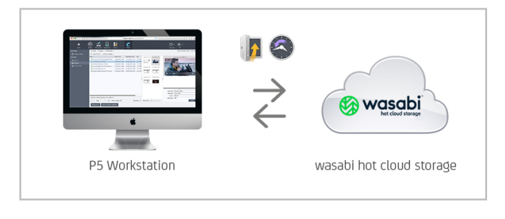
P5 Archive and P5 Backup to Wasabi hot cloud storage

P5 Backup and P5 Archive quickly copy or move data to Wasabi for durable protection at the lowest-possible cost. Backed up or archived data is first saved to local disk-based volumes, which are then backed up or archived to Cloud storage. Individual parts of the volume can be copied or downloaded, without the need to restore the entire volume as a whole. The local disk-based volumes can either be deleted automatically, or kept as a separate local copy to speed up restores. For a rapid restore, Wasabi provides immediate access to archived or backed up content.